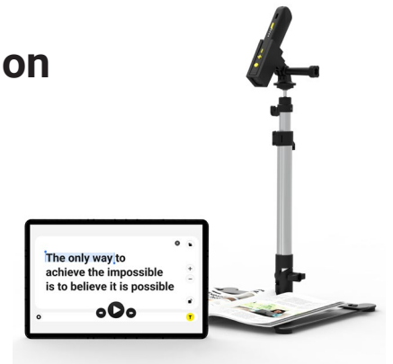
OrCam Read 3